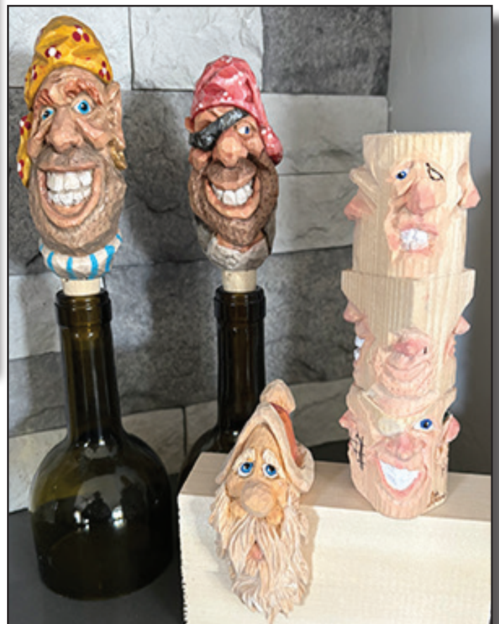
3 Face Projects