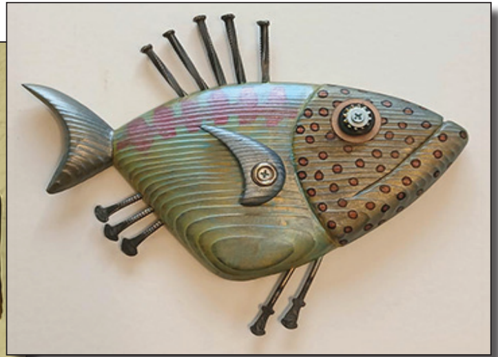
Fishes on Fire