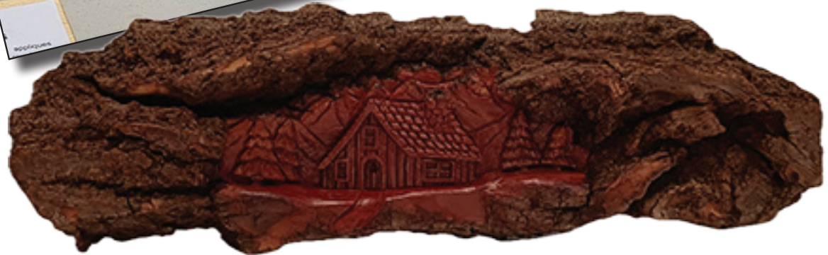
Cabin Relief in Cottonwood Bark