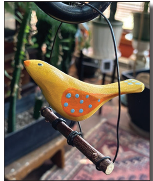
Bird on a Perch