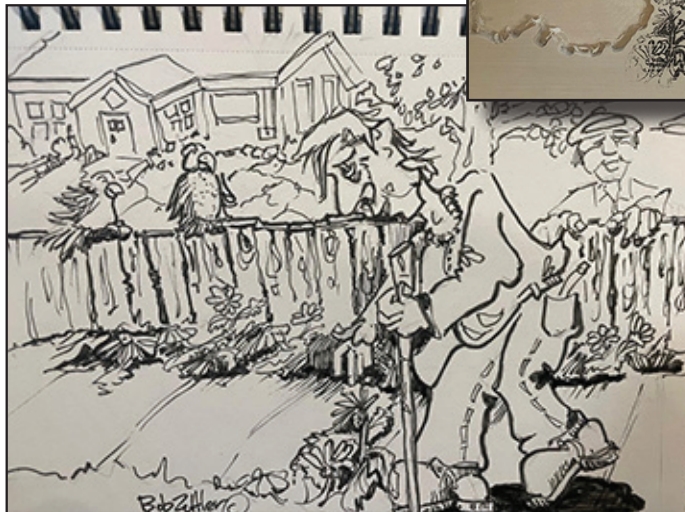
Caricature Relief Carving