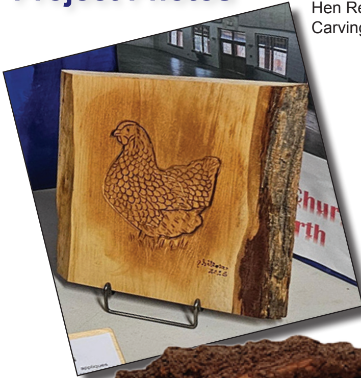
Hen Relief Carving