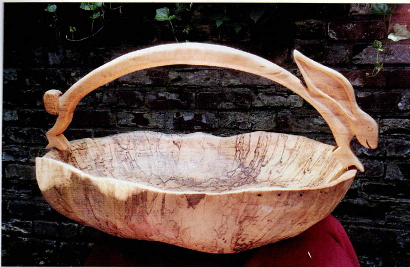
Jack Porter of Knoxville, Tennessee, carved this bowl out of spalted elm, and he used maple wood for the "rabbit" handle.