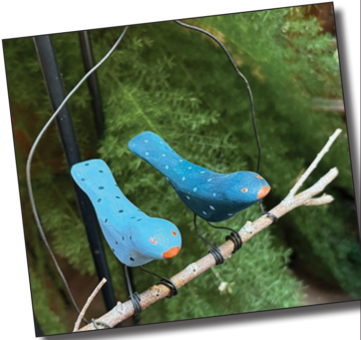
Bird on a Perch