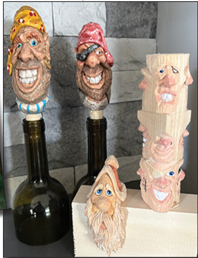
3 Face Projects