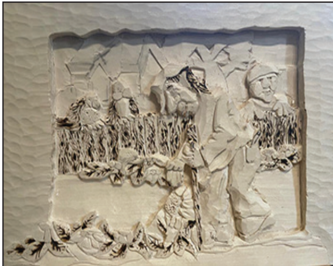
Caricature Relief Carving